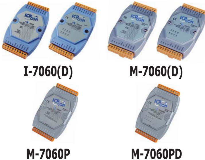
4-channel Isolated Digital Input and 4-channel Relay Output Module